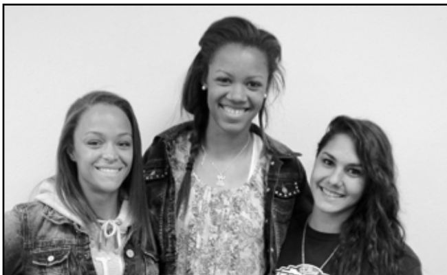
Turn to page 3 to find out why these Rosemont High School Seniors are smiling!