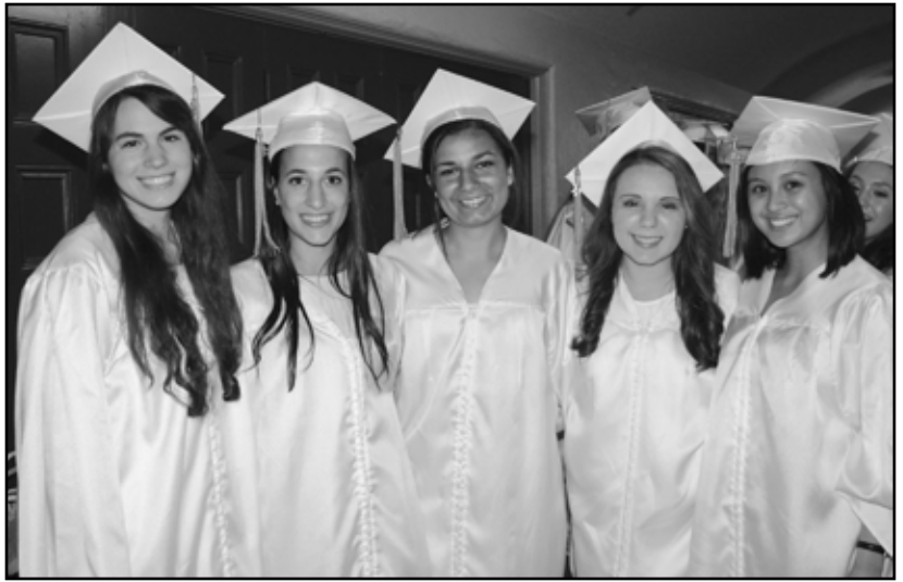
2012 St. Francis graduates line up for the Commencement Ceremony at Memorial Auditorium on May 23.

Through their Guidance Counselors, with the aid of the “NavianceSucceed” curriculum and college planning tool, St. Francis students are guided and encouraged in the process of researching their options to find the right “fit” college or post-secondary path. The 275 graduates of the St. Francis class of 2012 are now enrolled in 105 colleges and universities, effectively de-bunking the myth that there is only one path to success. College selections include some traditional California destinations, with 18 graduates attending Sac State, 13 traveling to Cal Poly San Luis Obispo, 10 to Santa Clara University and 9 each to UC Davis, University of San Diego and USF. Other popular choices include University of Nevada, Reno, Loyola Marymount University, Gonzaga University, San Francisco State, St. Mary’s College, Cal State Chico, and UCLA. Among the more recognizable schools, SFHS graduates will attend Brown, Columbia, Cornell, Duke, Georgetown, Notre Dame, NYU, Pepperdine, Pacific, Stanford, the US Naval Academy and Yale. Others have found their “fit” in size, culture, and curriculum offerings at a number of the UC campuses, the Franciscan University of Steubenville, Georgia Military College, Grand Canyon University, Louisiana State University,