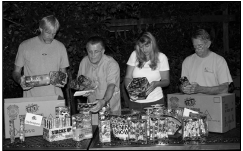
Volunteers look over the fireworks inventory in preparation for the big show.

This community activity provides an opportunity for the Association and the residents of Glenbrook and College Greens to come together for an evening of fun and to demonstrate community support for our local police, fire department, business sponsors, and elected representatives. We give a special note of thanks to TNT/Freedom/Red Devil Fireworks for providing all of the traditional fireworks for this event.