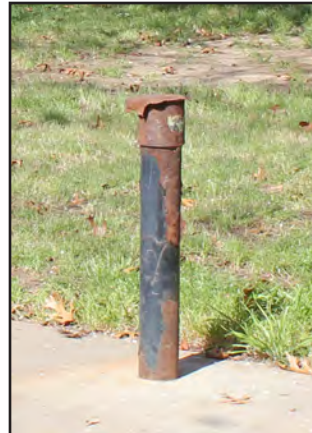
BBQ stand minus the BBQ.

Documents provided to the CGNA Board from the Sacramento City Attorney's Office report the 2013 revenue for the Oki Park Verizon tower at $20,419.96 and the AT&T tower at $20,684.17 for a total of $41,104.13. Given the backlog of