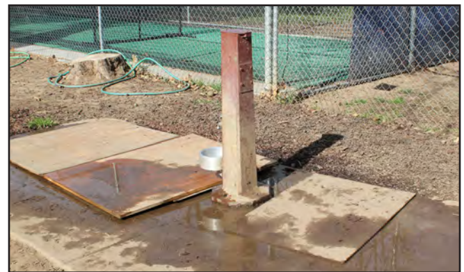
Malfunctioning dog and human water fountain.