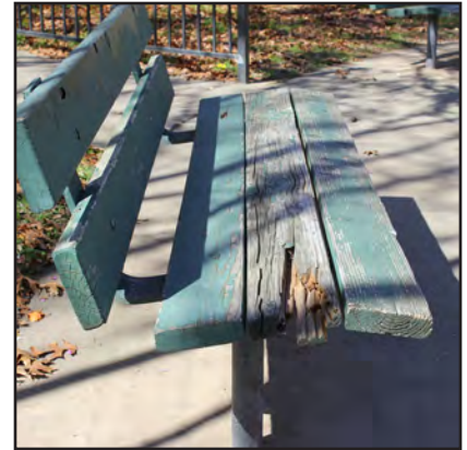
Park bench showing weather wear.