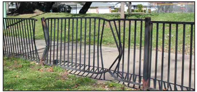
Broken playground fence in need of repair.