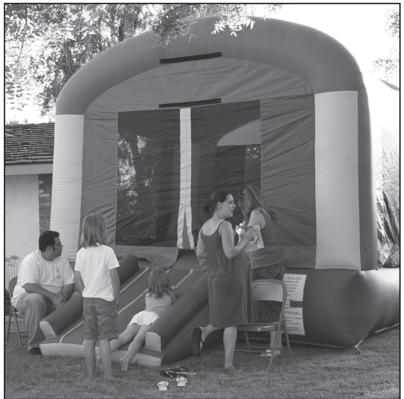
The bounce house is a favorite attraction every year.