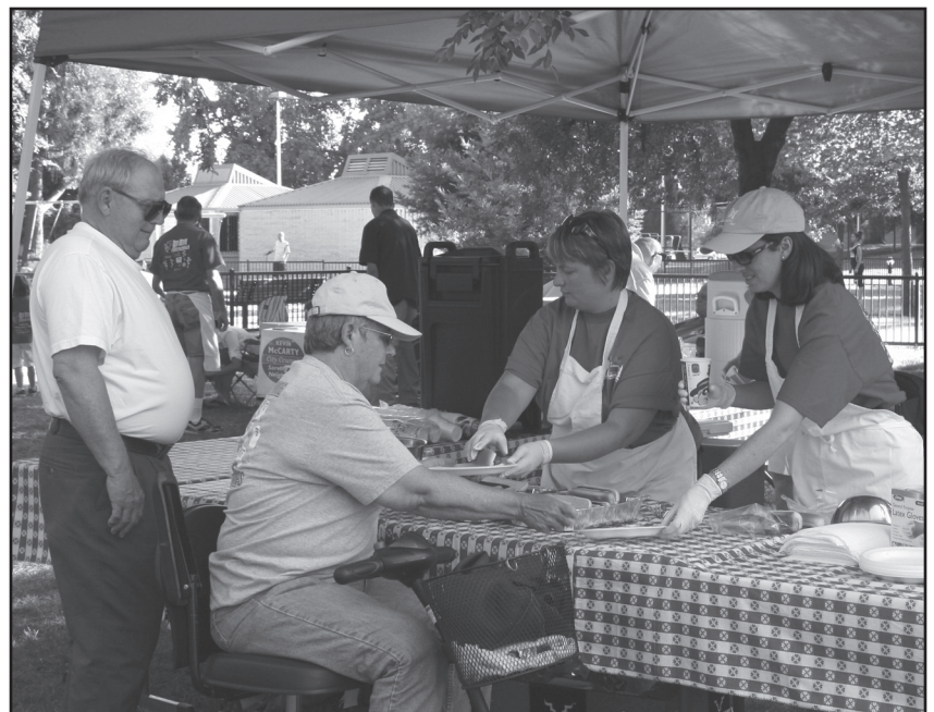
Free hot dogs, chips and drink keep offered by CGNA volunteers.