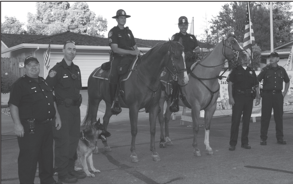
Thank you to our neighborhood law enforcement for watching over us every day.