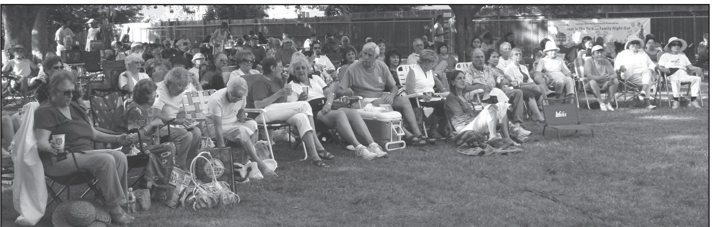
Sit back, relax, and enjoy some jazz!