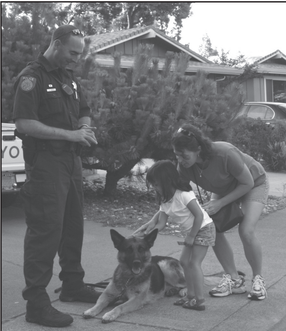
Getting to know the K9 unit. Good doggie.