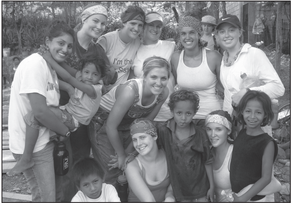
St. Francis High School graduates in Guatemala, where they built a Habitat for Humanity home.