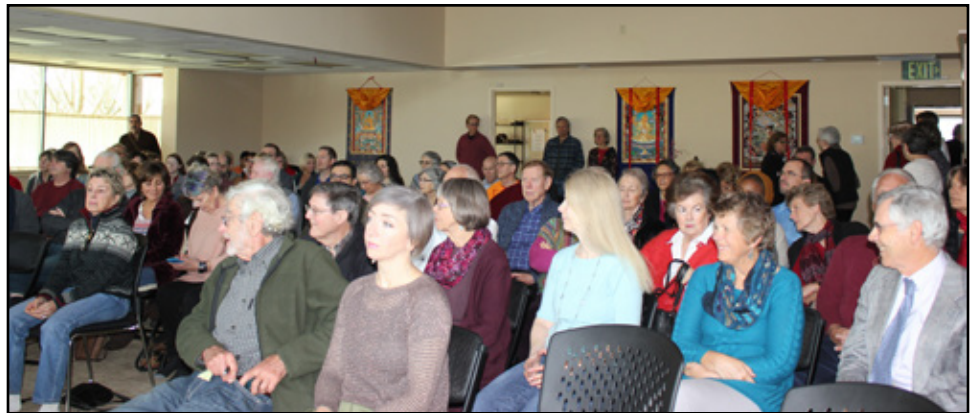
Visitors learn more about the Sacramento Dharma Center at their grand opening.