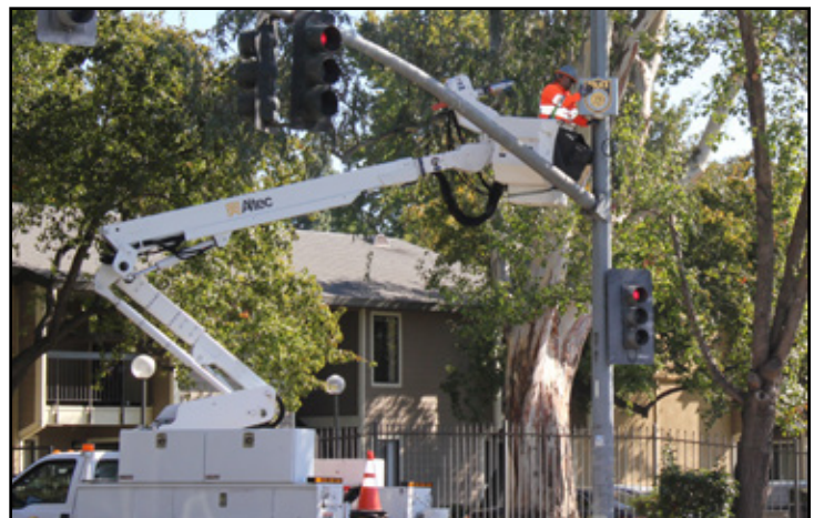
City crews install PODs at Folsom Boulevard & Julliard (top) and LaRiviera Drive & Howe Avenue (bottom).