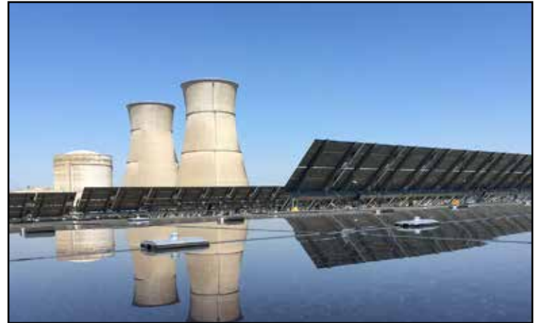
Solar panels at Rancho Seco.

SMUD started SolarShares for residential customers in 2008 as one of the first community solar programs in the country. The program allows customers to buy a set amount of local solar generating capacity that offsets some of their electric bill. With the construction of five new solar arrays at Rancho Seco, SolarShares is expanding to offer the same benefits to business customers.