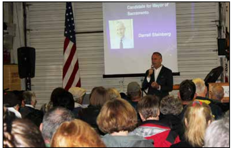
Sacramento Mayoral Candidate Darrell Steinberg addresses College-Glen residents at the May candidate forum.