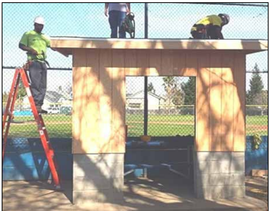
NCCT works on the construction of a CGLL score booth