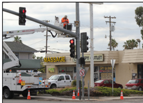
Notre Dame Drive and Folsom Boulevard