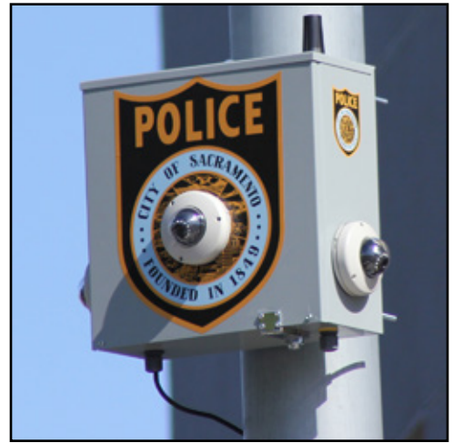
A Police Observation Device (POD)

While the newly installed PODs may not be the entire answer, they may be acting as an additional deterrent. The excellent neighborhood policing and relationship our neighborhood association has with the Sacramento Police Department along with the diligence of each one of us in keeping an eye out for suspicious activity are certainly contributing to a safer environment. Let's keep it up!