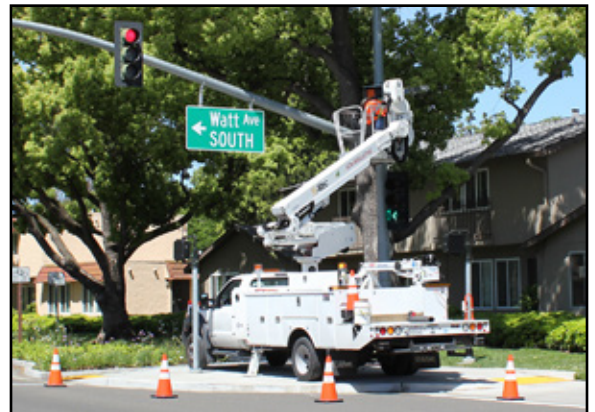
Watt Avenue and La Riviera Drive