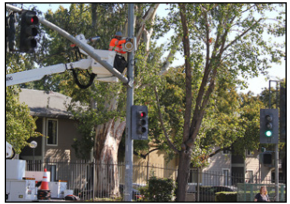
Howe Avenue and La Riviera Drive