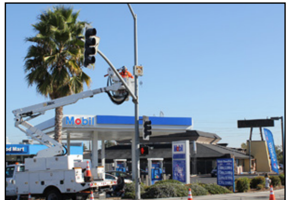
Julliard Drive and Folsom Boulevard