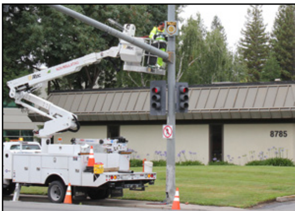
East of Wisemann Drive and Folsom Boulevard