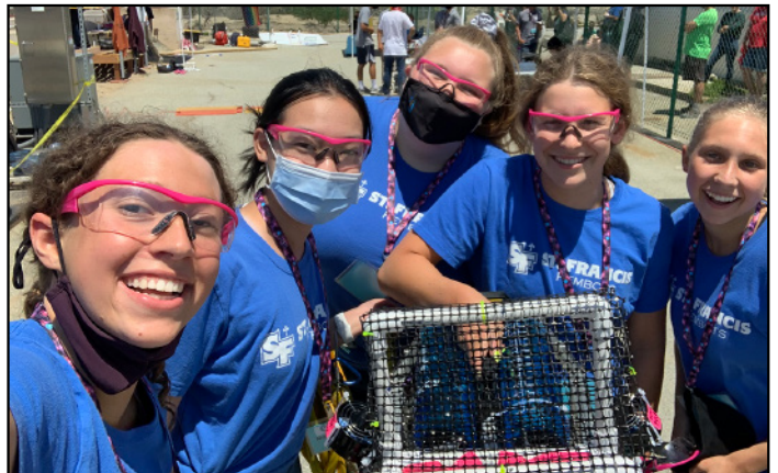
Robotics team, the Geneseas, will compete in the World Championships in Tennessee in August.