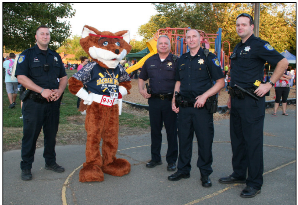
Supporting the College-Glen Neighborhood Family Night Out.

Recently, the Association/Foundation Board voted to write a letter in support of full funding for the Sacramento Police Department with support for additional officers. The Association/Foundation has always supported our local law enforcement and fire departments and will continue to do so as we view their services as crucial to the safety and well-being of our neighborhoods, area business, residents, and youth. When you call 911 these are the city employees that will be there to help.