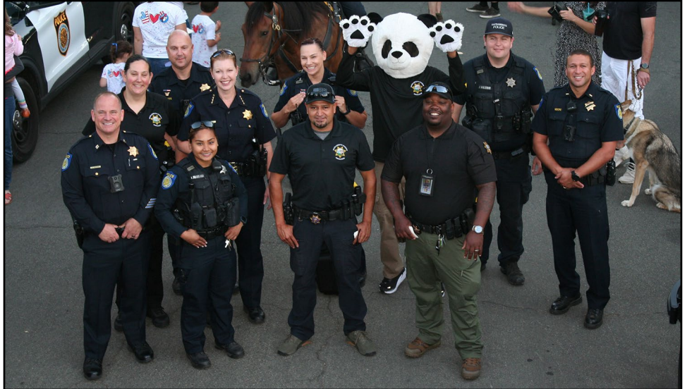
Sacramento City Police and Sacramento County Probation

Please see pages 8-9 for more photos of the event.