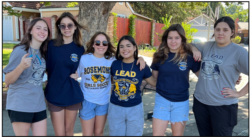
The set-up crew from Rosemont High School