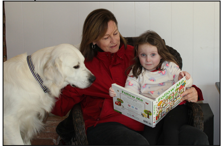
Everyone loves to settle in for story time!

The NEA suggests • Start Early: The ideal time to begin sharing a book with your child is infancy. • Surround Your Child with a Reading-Rich Environment. Make your home print-rich!