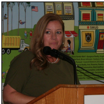
Angelique Ashby, CA Senate Dist. 8