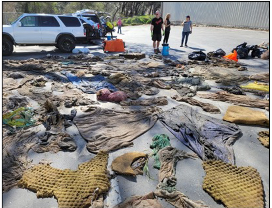
A portion of the textile armor removed from less than 300 feet of Arcade Creek, downstream from Auburn Boulevard. Bags contain additional small textiles. (Feb. 2022)

A number of our local streams have textile armor up to 6 inches thick that covers 60-90% of their bottoms. Removing it requires wading into the stream with a sharp-tined garden cultivator or hay hook, and hauling out sometimes hundreds of pounds of saturated cloth. When this is done, a "burp" of gray, foul-smelling water rises from the anoxic zone below. And each time, another small area of the cradle of life is returned to the watershed.