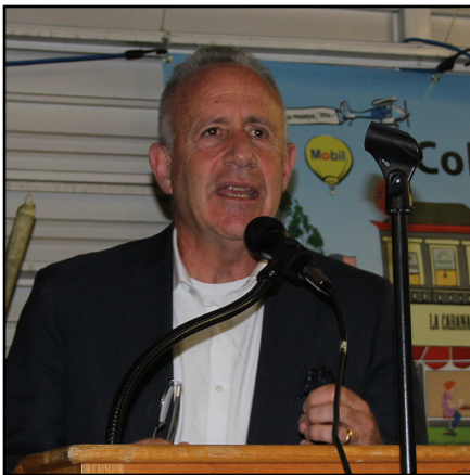
Darrell Steinberg, Sacramento Mayor