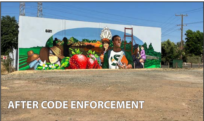
AFTER CODE ENFORCEMENT