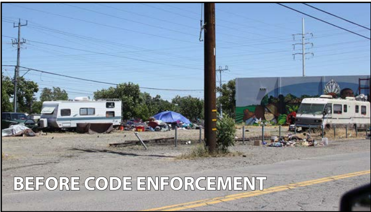
BEFORE CODE ENFORCEMENT